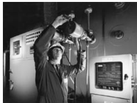
High integrity, self-monitoring float controls