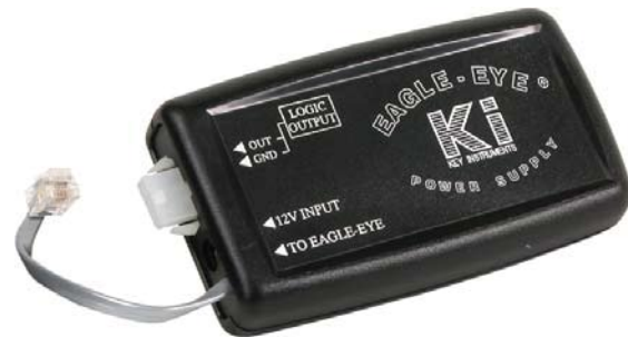
Advanced Power Supply (EPS004)