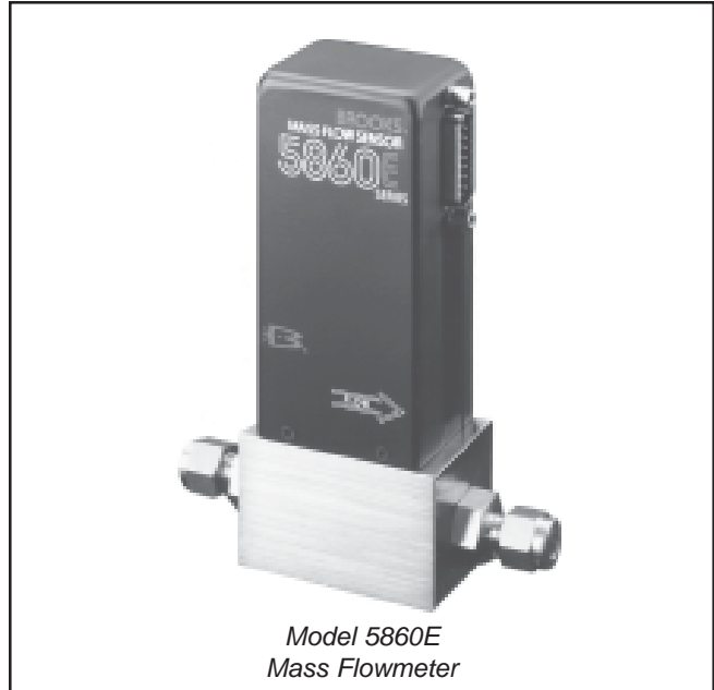
Model 5860E Mass Flowmeter

Maximum Operating Pressure: 4500 psi (31.03 MPa) Ambient/Operating Temperature: 40°F to 150°F (5°C to 65°C) Non-operating: -13°F to +212°F (-25°C to 100°C)