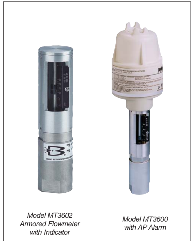
Model MT3602 Armored Flowmeter with Indicator