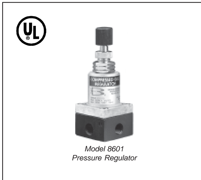
Model 8601 Pressure Regulator

Valve Adjustment & Operating Ranges - fifteen turns for 0-10, 0-30, 0-60, 0-100, 0-150 or 0-200 psig output range